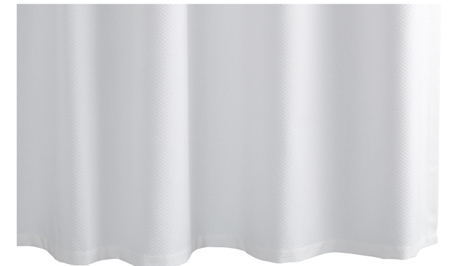
BELGIAN WAFFLE Available in White.