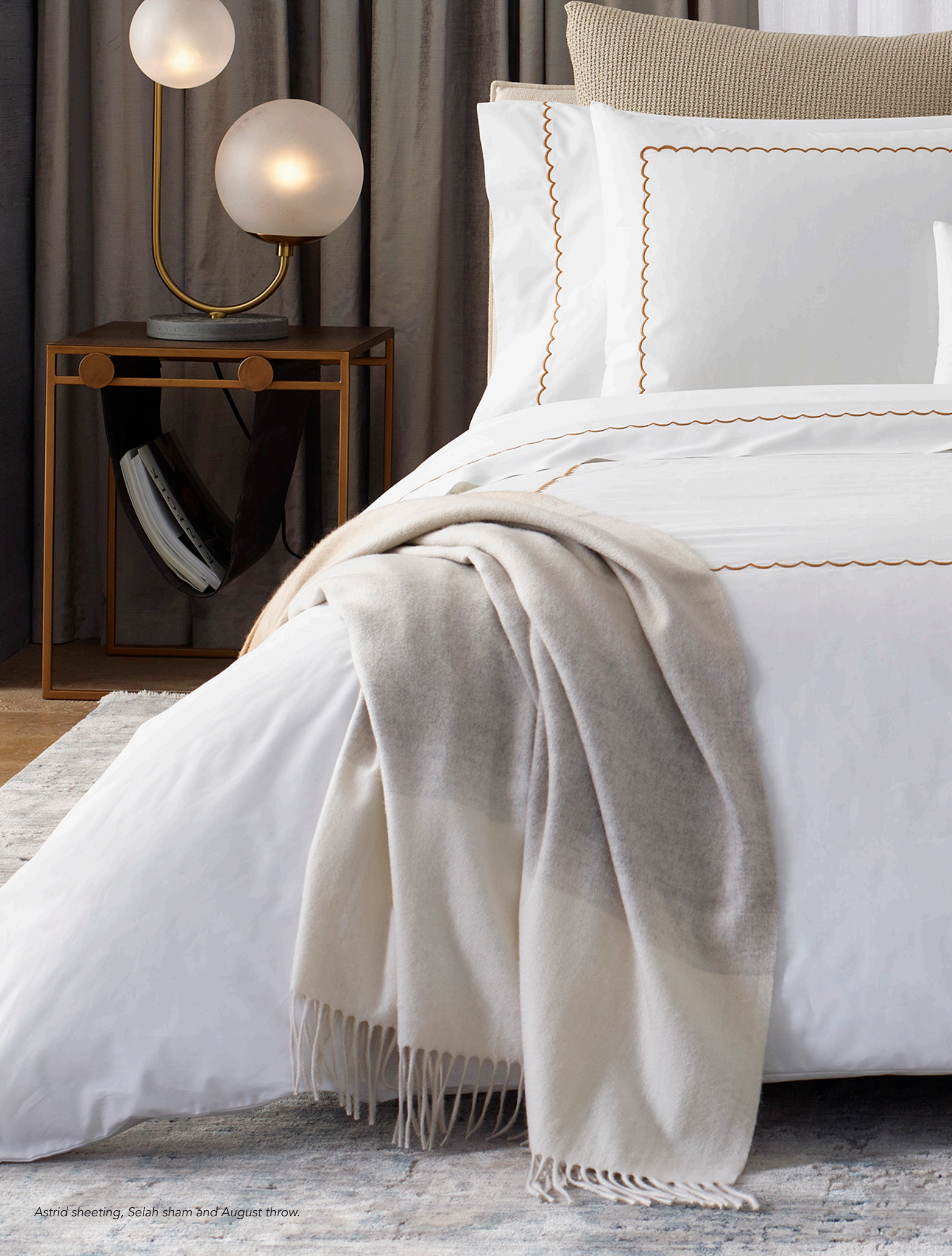
Astrid sheeting, Selah sham and August throw.