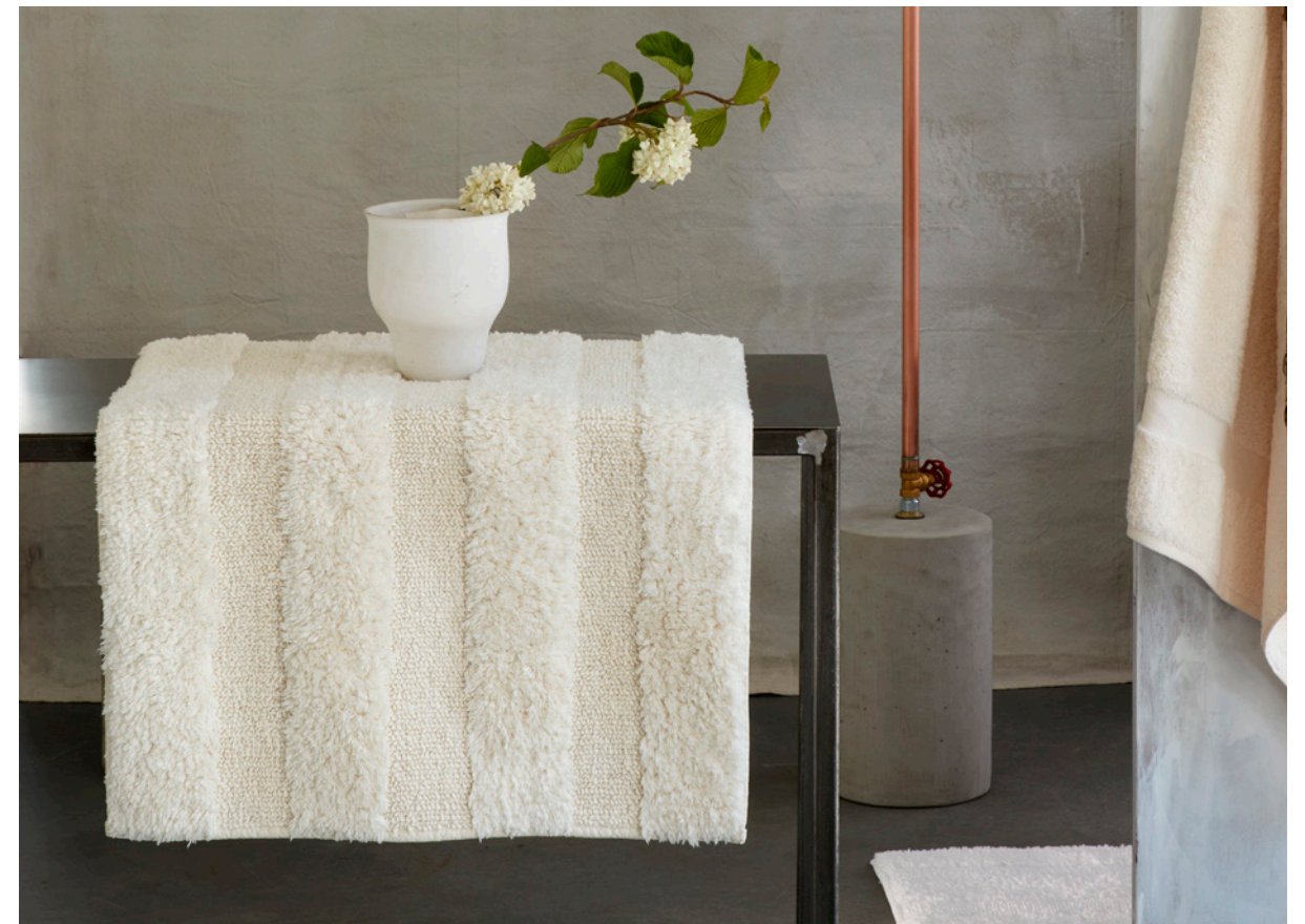
Hudson bath rug.

An inviting bath rug is the perfect detail to make a hotel bathroom feel as comfortable as home. Our assortment offers deep, plush piles, sculpted textures and patterns, and refined colors that coordinate beautifully with our bath linen styles. 100% cotton makes each rug wonderfully soft and absorbent, and most rugs are backed with long-lasting non-slip dots.