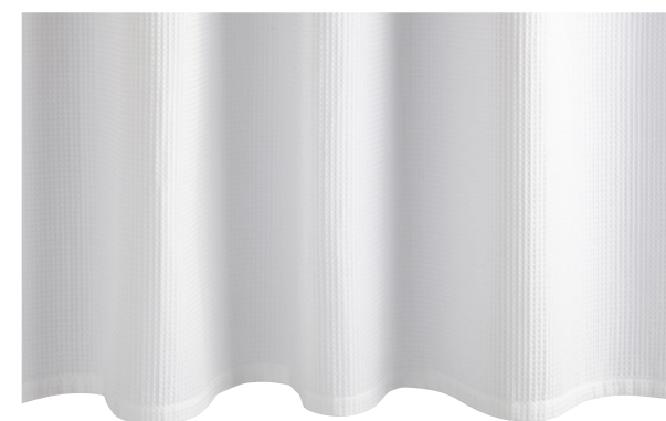
LANAI Available in White.