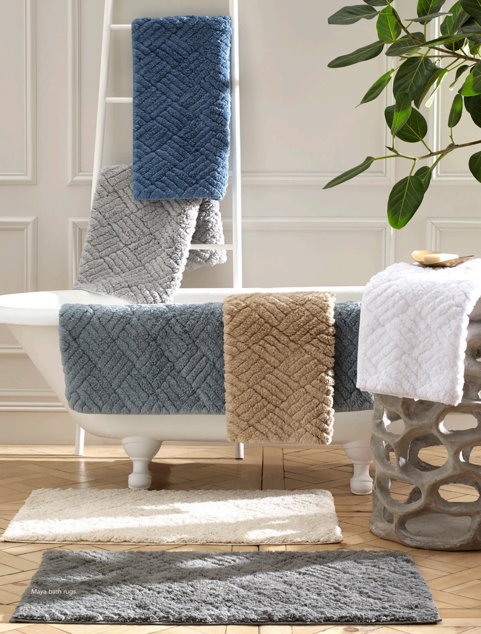
Maya bath rugs.