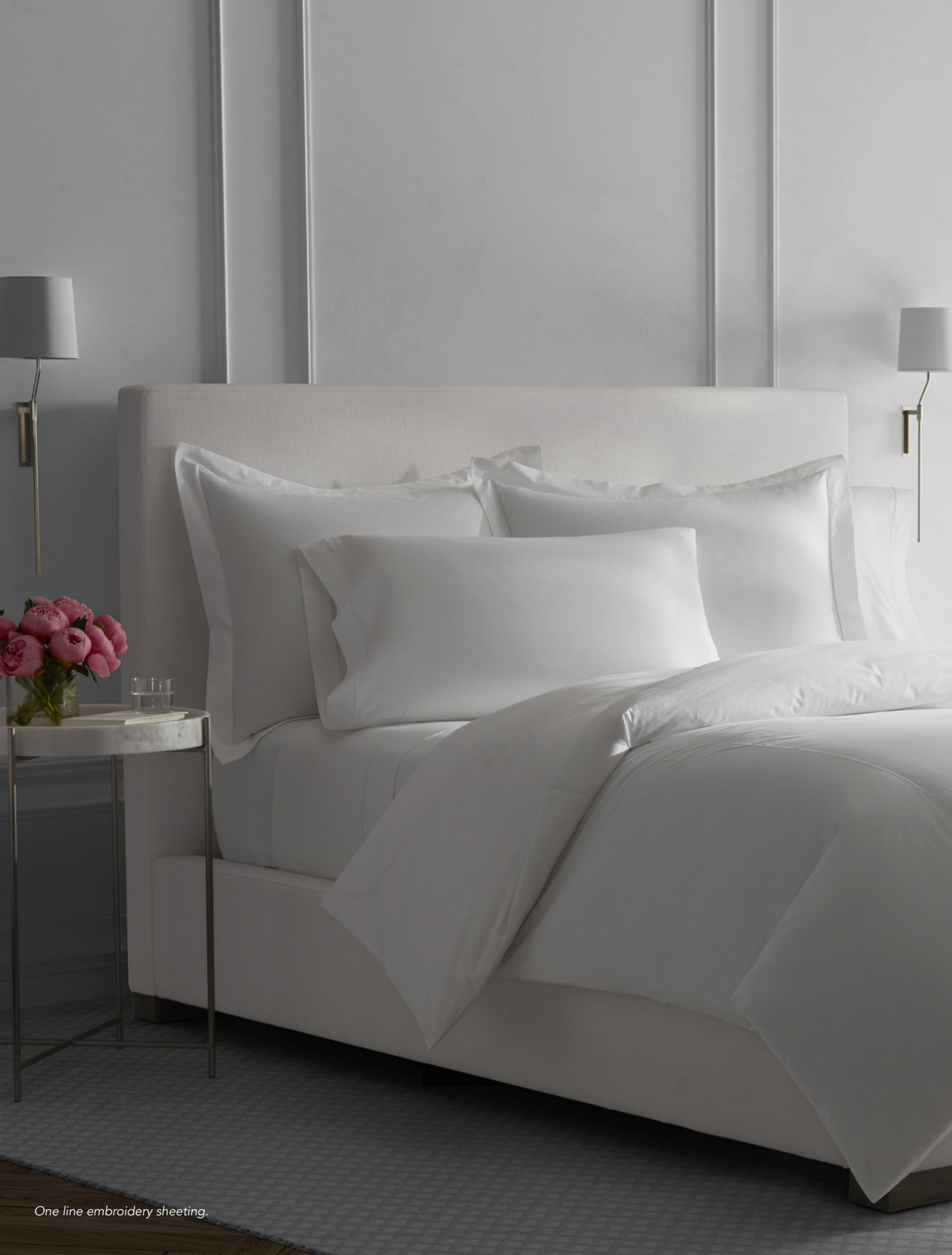
One line embroidery sheeting.