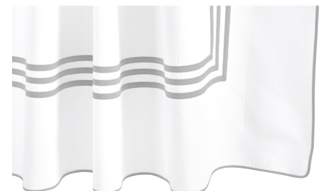
NEWPORT Over 100 tape colors available.