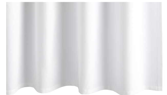
SEERSUCKER Available in White.