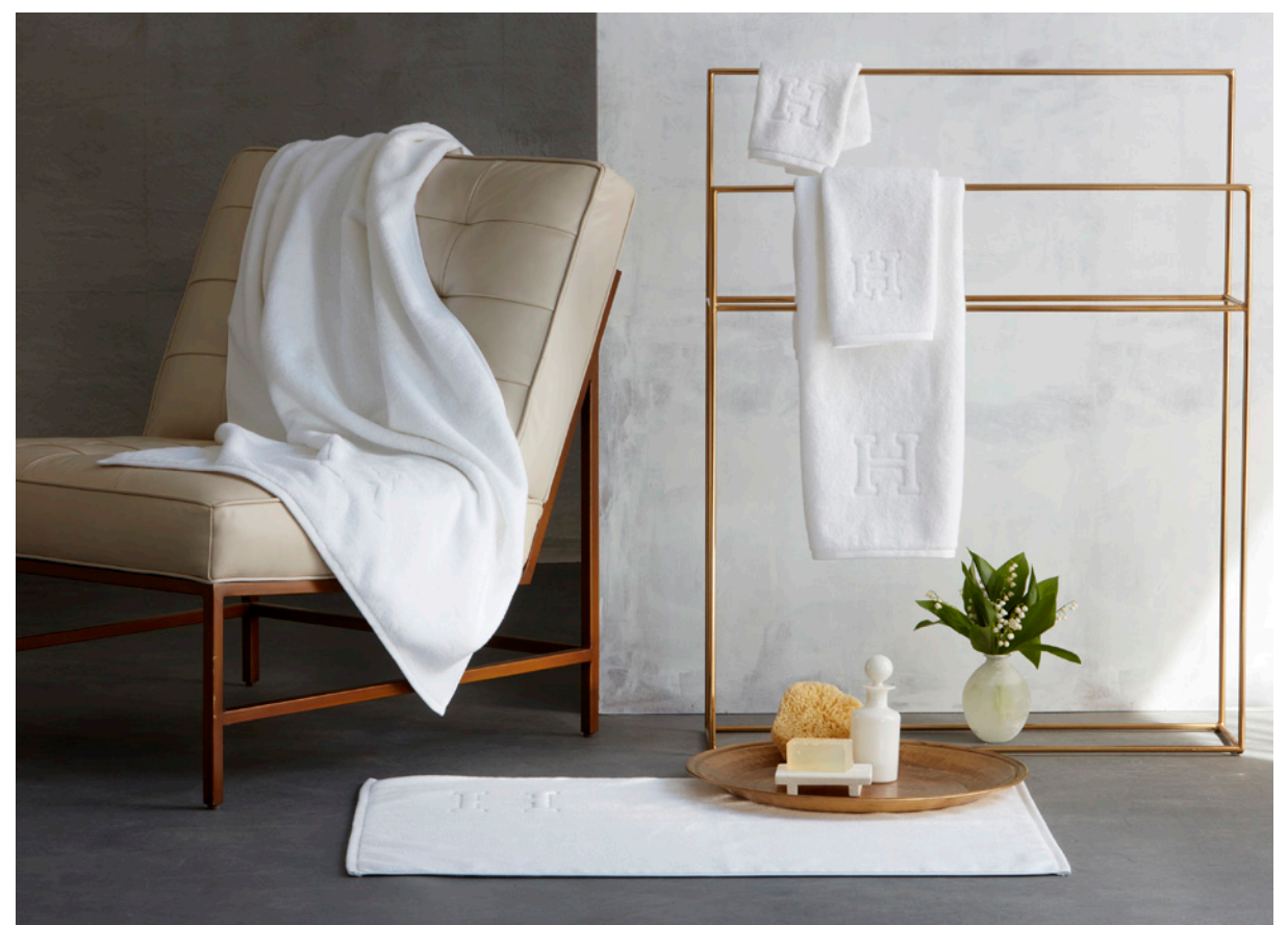
Auberge towels and tub mat.

We've created a bath collection that includes iconic Matouk styles as well as styles developed specifically for hotels, such as Regent, Viceroy, and Domaine.