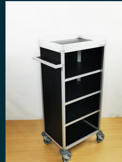
CART N° 2

transport of dirty linen and garbage: completely closed to avoid contaminations