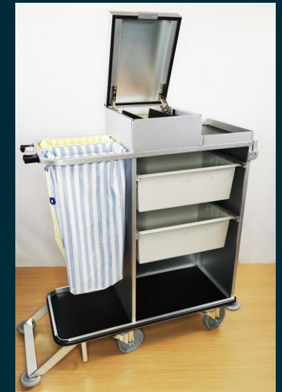
CART N° 3

transport of cleaning equipment and "infected" room items. Once the guest checks out, the housekeeper puts inside the basket all "infected" items that cannot be thrown away such as menus, brochures, and hairdryers. The basket with the "infected" content will be then removed and replaced with a basket with sanitized items.