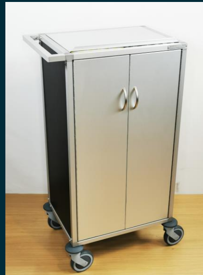
CART N° 1

3 trolley system. All 3 carts connect via hooks and can be connected and pushed together when needed.