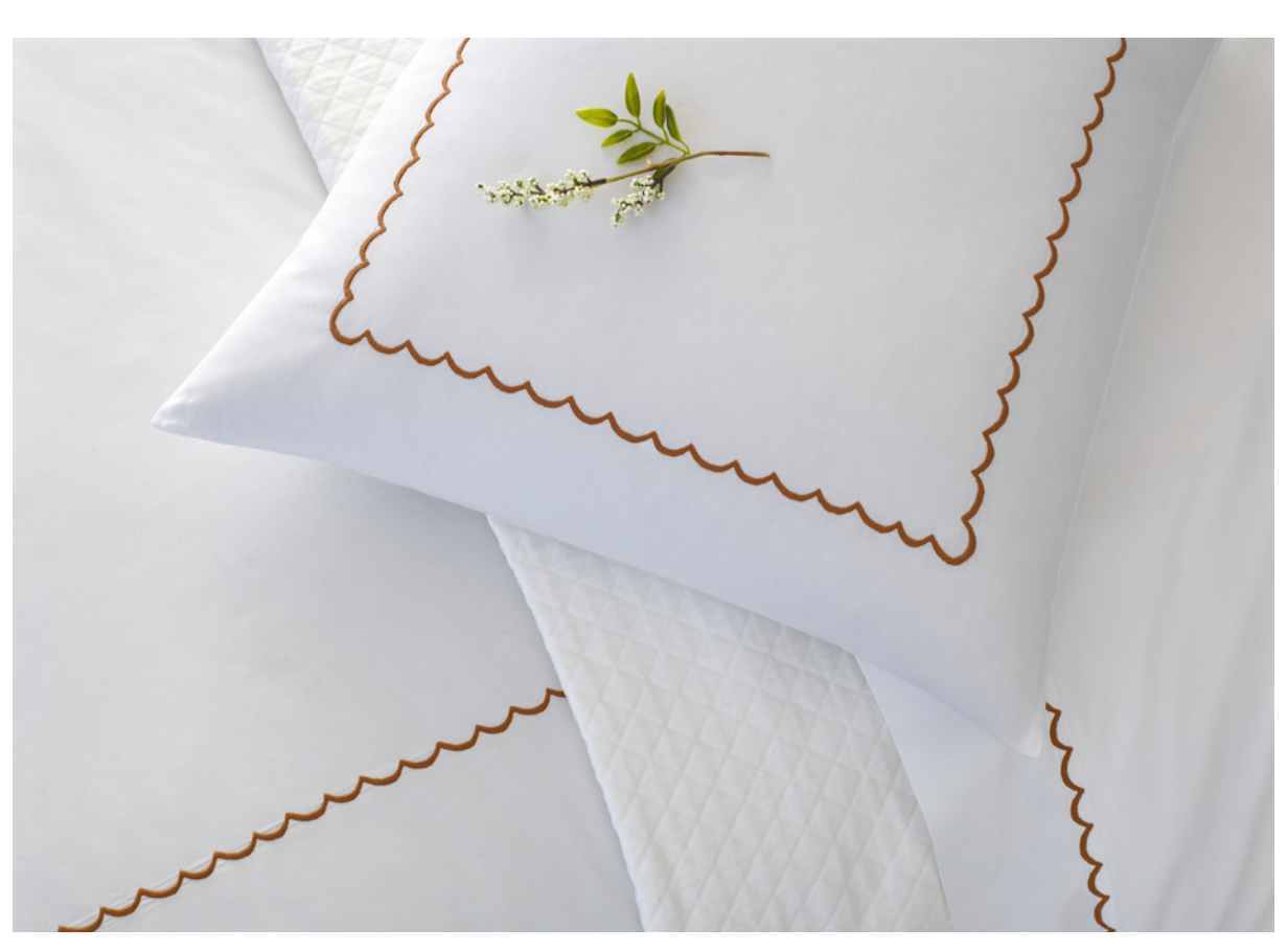
Astrid sheeting and Gemma coverlet.

Choose plain, classic white or opt for the elegant embroidered accents that are a Matouk signature. Most colors and styles are stocked for quick delivery, and we offer an extensive palette of custom colors to help you achieve the exact look you want. When you combine these sheets with our quilts, coverlets, and down bedding, you're delivering a restful, luxurious night's sleep your guests will never forget.