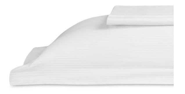
BIANCA White on white stripe 300 TC / 100% cotton sateen