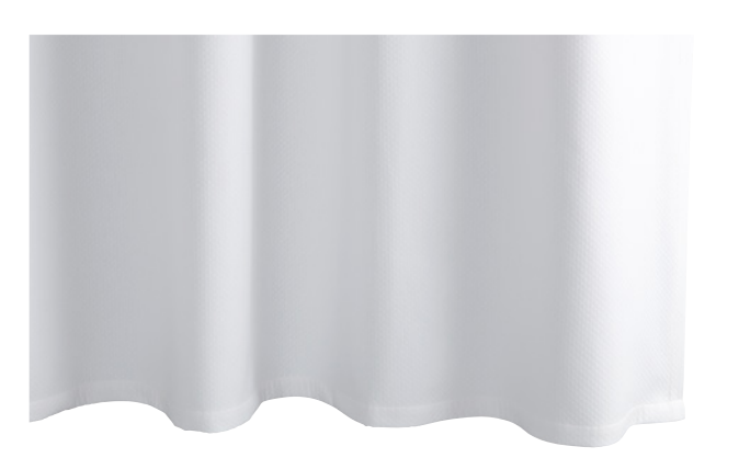
DIAMOND PIQUE Easy-care pique. Available in Bone and White.

Our shower curtains are designed to be both practical and beautifully decorative. In addition to the standard 72 \times 72 -inch size, we can produce custom sizes for ADA-compliant and other non-standard baths.