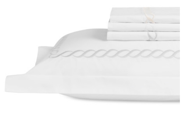
CARMEN Classic Chain embroidery in Ivory, White, and Silver 350 TC / 100% cotton percale