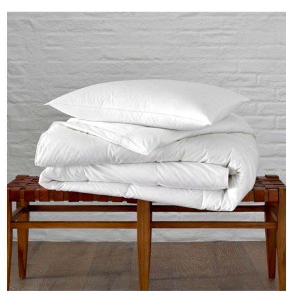
SOFIA Duck down