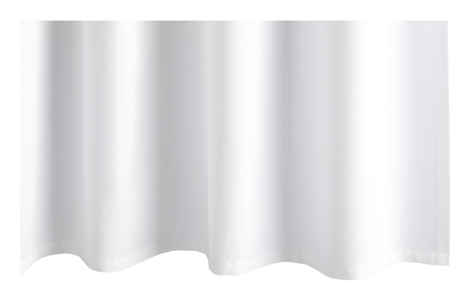
BIRDSEYE PIQUE Easy-care birdseye pique. Available in White.