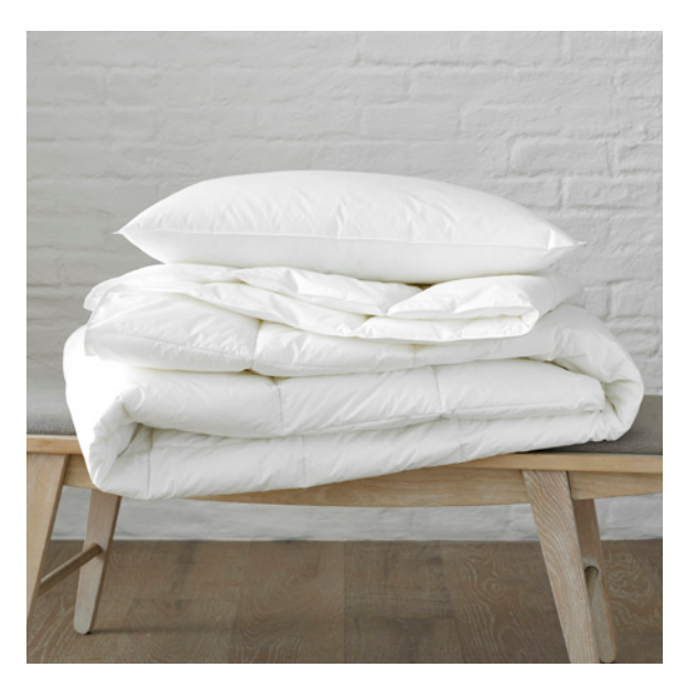
APOLLONIA Down free

For the ultimate in comfort, Matouk offers two American-made down bedding collections that are exclusive to our hotel clients. Sofia creates supreme plushness and loft using hypo-allergenic white duck down fill in a baffle-box shell of 300 thread count cotton percale, while Apollonia substitutes a down-alternative fiber to accommodate allergy-suffering guests. Comforters are available in summer and all-season weights and our pipe-edged pillows vary in fill quality and firmness. Every down product is certified by the internationally recognized "Responsible Down Standard" (RDS), ensuring that all down and feathers are humanely sourced.