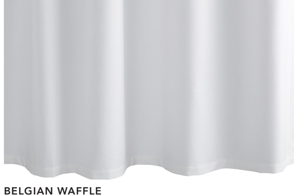
Waffle weave. Available in White.