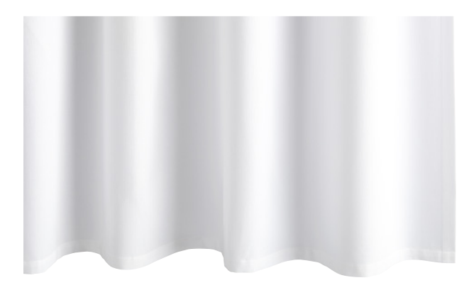
SEERSUCKER Seersucker stripe. Available in White.