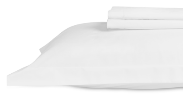
DAMIANO Plain or with one line of white satin stitch 200 TC / 50% cotton 50% polyester percale