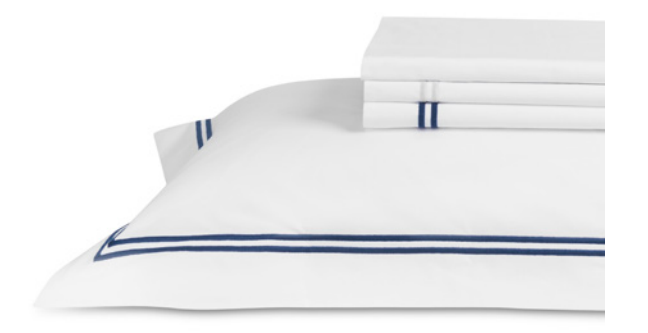
SIERRA Plain or with two lines of navy or silver satin stitch 350 TC / 100% cotton percale