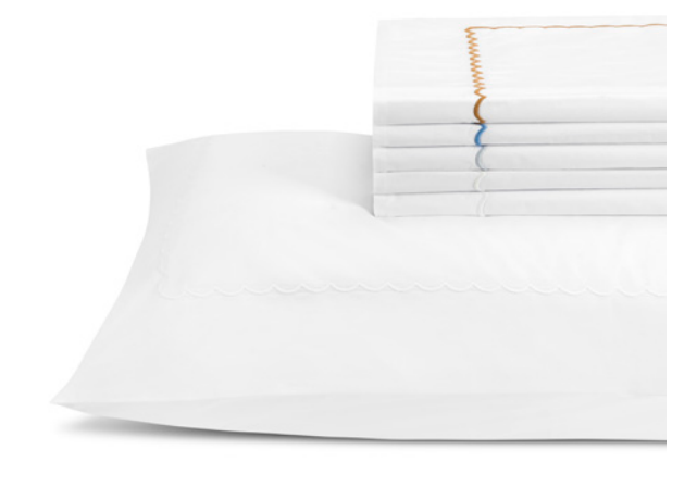
ASTRID Scallop embroidery in Ivory, White, Azure, Champagne, Silver 350 TC / 100% cotton percale