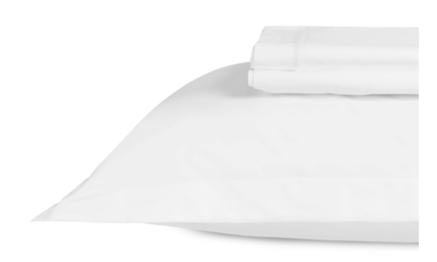
NICOLO Plain or with one line of white satin stitch 200 TC / 100% cotton percale

Sheeting fabrics range from the wrinkle-free fused poly-cotton of Damiano to an assortment of 100% cotton, cotton percale, and cotton sateen weaves in a variety of thread counts. All are made with long-lasting performance in mind.