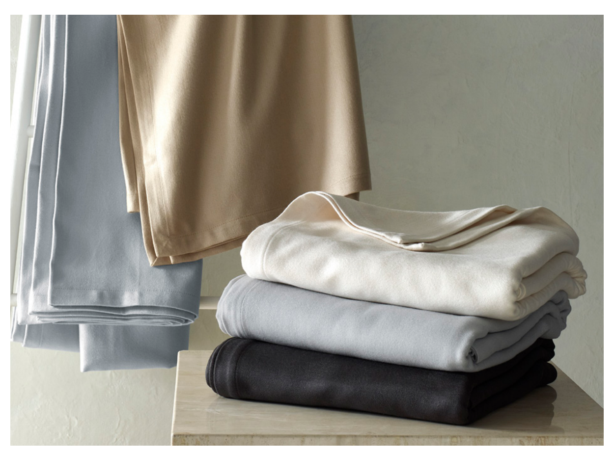
Dream Modal blankets.

Cozy blankets and throws are a wonderful way to evoke the comforts of home. Our 100% cotton blankets are soft, warm, and designed to complement any of our bedding styles. Not only do our throws add beautiful texture, color, and pattern to the room's composition, but they encourage guests to rest and unwind.