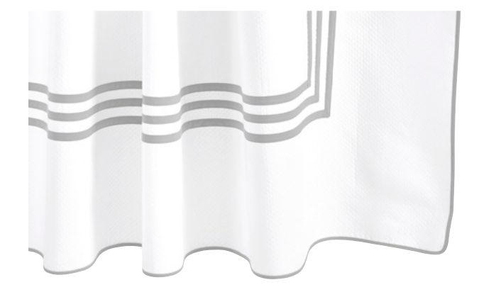
Easy-care pique with three rows of tape. Over 100 tape colors available.