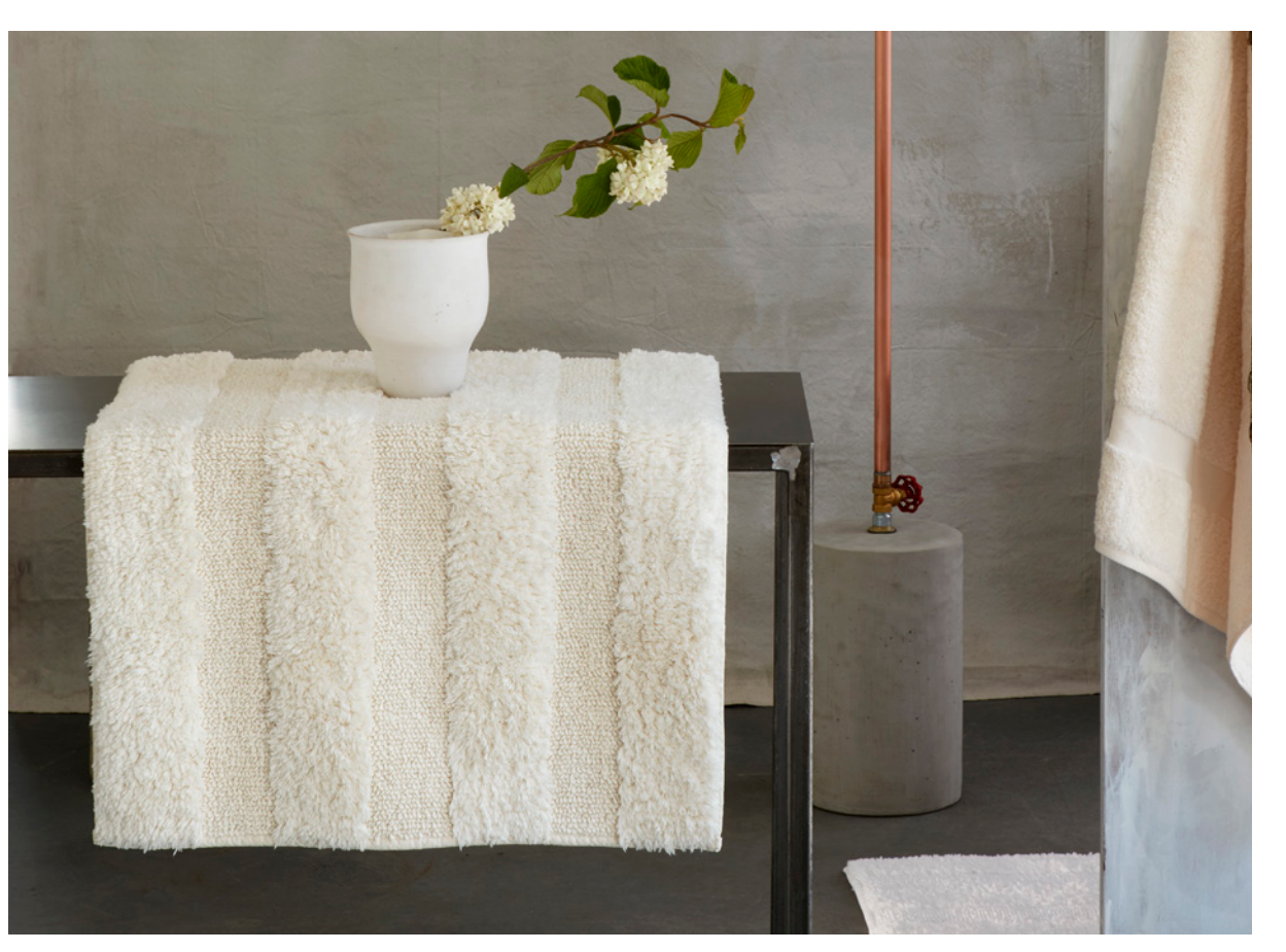
Hudson bath rug.

An inviting bath rug is the perfect detail to make a hotel bathroom feel as comfortable as home. Our assortment offers deep, plush piles, sculpted textures and patterns, and refined colors that coordinate beautifully with our bath linen styles. 100% cotton makes each rug wonderfully soft and absorbent, and most rugs are backed with long-lasting non-slip dots.