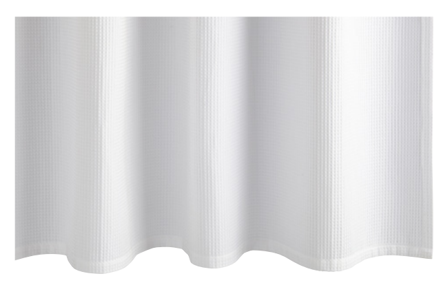
LANAI Easy-care pique. Available in White.