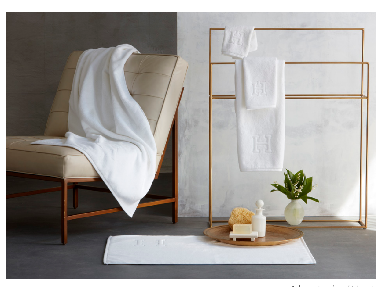
Auberge towels and tub mat.

Decades of expertise and a commitment to quality have made Matouk an irreplaceable bath linen brand in countless homes and for discerning hotels. Combining the finest cotton with meticulous craftsmanship, these towels offer luxurious softness, absorbency, and cost-effective durability. Customize them for your property with the addition of an embroidered logo or monogram, or opt for an embossed monogram when you choose our Auberge style.