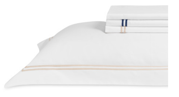
Plain or with two lines of navy or champagne satin stitch 300 TC / 100% cotton sateen