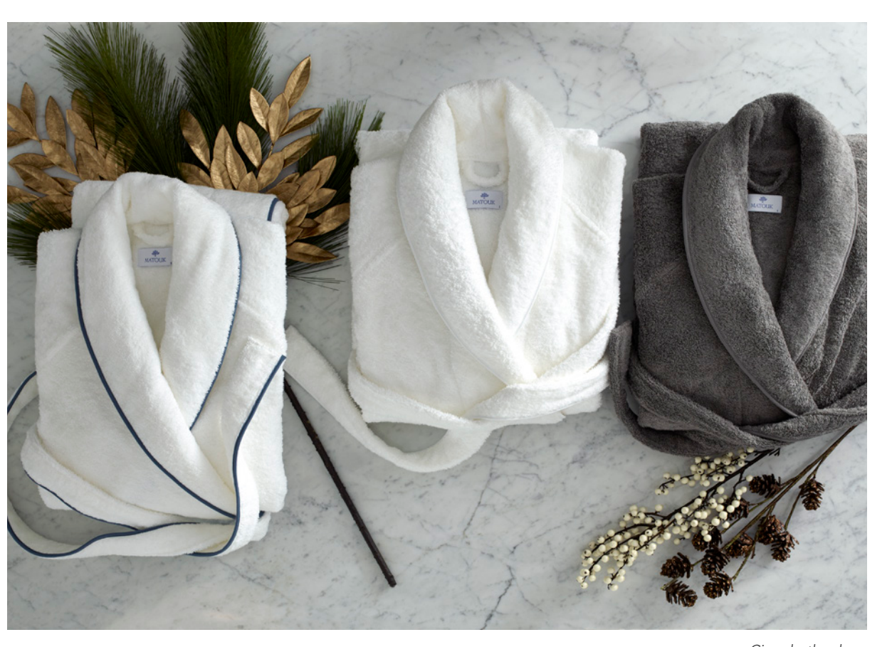
Ciaro bath robes.

Our selection of bath robes has been carefully developed to serve any type of hotel, resort, or spa, in any climate and on any budget. In addition to the hotel-exclusive Velour robe, we offer a selection of Matouk's most coveted styles, from the plush, zero-twist cotton of Milagro to our remarkably supple cotton-bamboo blend, Kiran. Each robe can be easily customized with an embroidered logo or monogram in your choice of color.