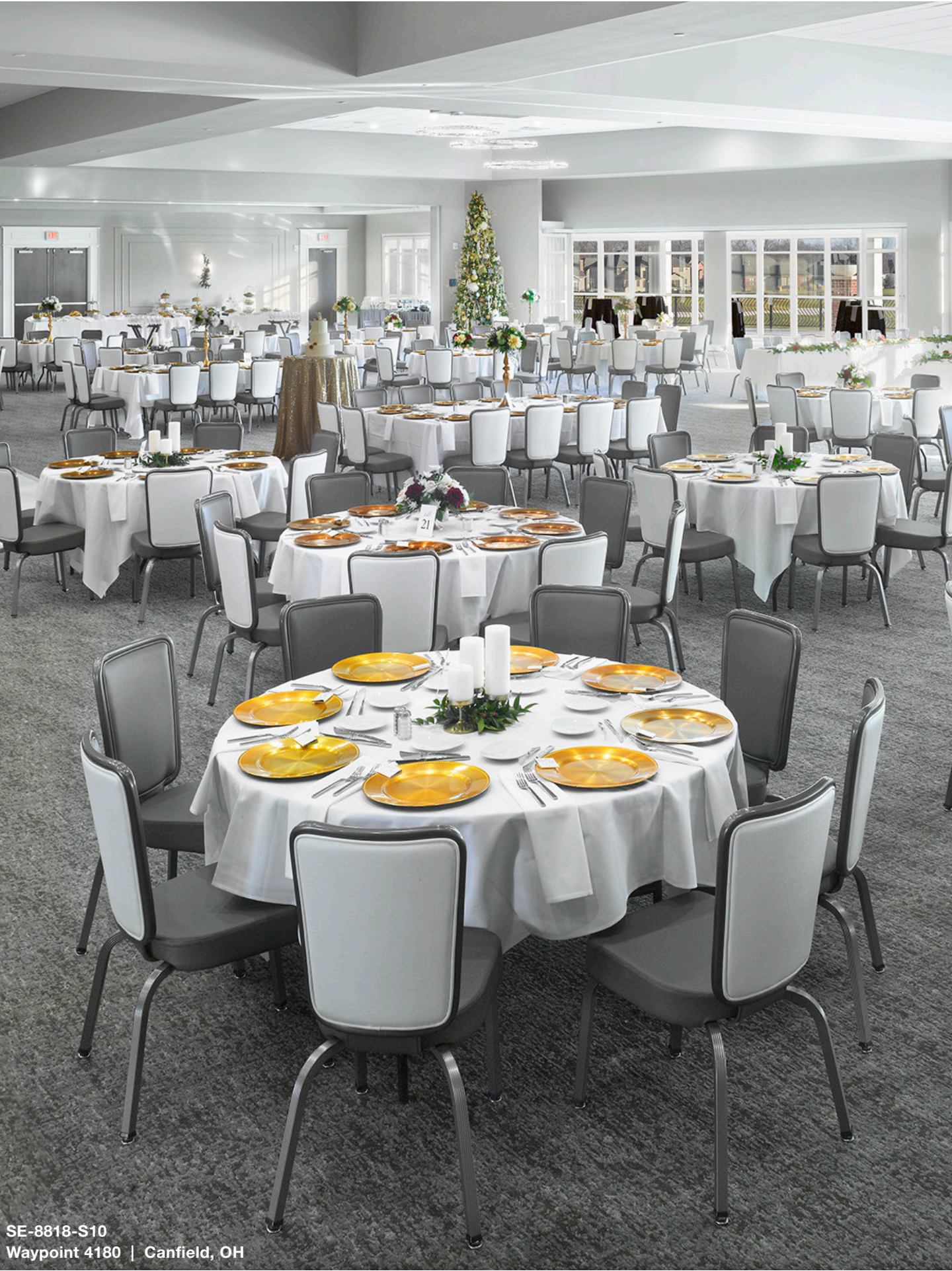
SE-8818-S10 Waypoint 4180 | Canfield, OH