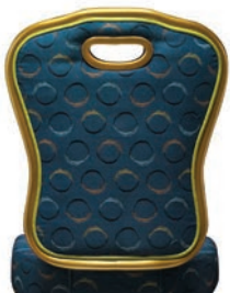
HAND HOLD 3 (HH-3) Hole through backrest