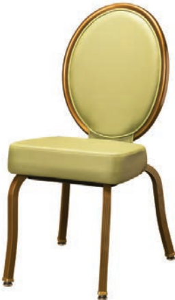
SE-8802-S10-OLT/2 Shown with optional Ornate Leg Tube