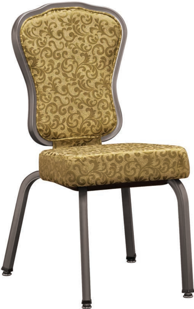
SE-8800-S10 Shown with Gasser's new Murano Leg Tube Shown with Gasser's new Murano Edge

One of our original and proven performers, the SE, combines classic design and modern performance at a value you won't need to sit down for. The sleeker, more compact, low profile is perfect for venues with smaller footprints or spatial constraints, providing maximum seating possibilities while its ergonomically molded cushions supply maximum comfort for your guests.