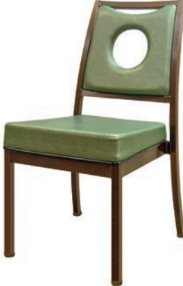
GTW-105B Integrated Hand Hold Standard on this Model