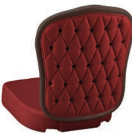
SEWN BUTTON TUFTING (BTO) Sewn diamond-shapes in padded inside or outside upholstery of backrest with decorative nails