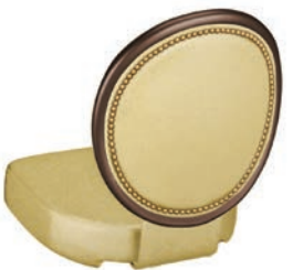
HEAD TO HEAD TACKING (HHTO) Decorative nails applied individually around the inside or outside perimeter of backrest