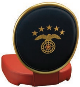
CUSTOM EMBROIDERY Your logo embroidered to personalize your chair