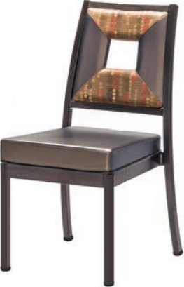
GTW-104B Shown with optional Accent Upholstery