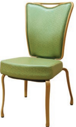
KL-9050-S10 Shown with optional Integrated Handle* *Not available on all models