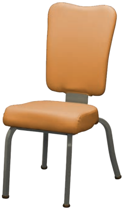
ARN-101 Shown without Hand Grip