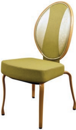
KL-9020-S10 Shown with optional Accent Upholstery