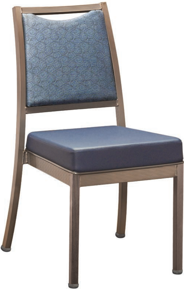
GTW-103B Shown with optional Integrated Hand Hold

The end of the American Revolution gave way to the birth of a bold new nation and an exciting era of transformation known as the Federal period – an age of independence and rise to a uniquely American furniture style. Gasser now introduces the Georgetown series; a revolutionary statement that re-awakens this historical period, capturing its rich heritage by evoking classic imagery from ‘across the Potomac’ with a modern day edge.