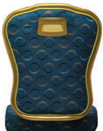
FINGER GRIP 10 (FG-10) Finger grip integrated in backrest