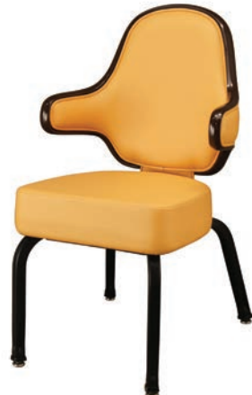
ASE-1228+4-S6 Shown with optional Tall Back