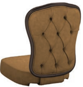
DIAMOND TUFTING (DTO) Hand-pleated tufting with deep foam padding on inside or outside of backrest