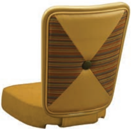
SEWN SCALENE & BUTTON (SBO) Sewn triangular pattern on outside of backrest with decorative button