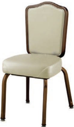
SE-8810-S10 Shown with optional Waterfall Seat