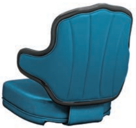
SEWN CHANNEL TUFTING (CH) Sewn channel-shapes in padded inside or outside upholstery of backrest