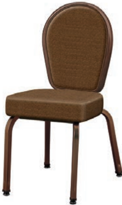
SE-8816-S10 Shown with optional Reed Edge