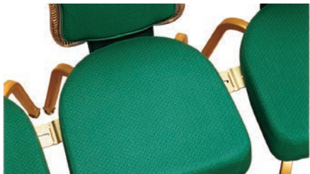
RETRACTABLE GANGING BRACKET (GB-2) Brackets slide under the seat when not required