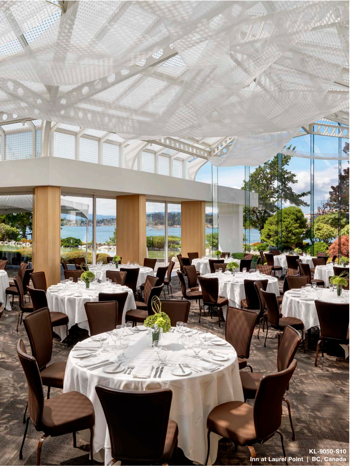
KL-9050-S10 Inn at Laurel Point | BC, Canada