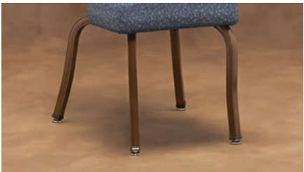
ORNATE LEG TUBE (OLT/2) FRONT VIEW High strength aluminum square tube frame featuring ornate front and rear legs. Available in smooth, ribbed or Murano profile.