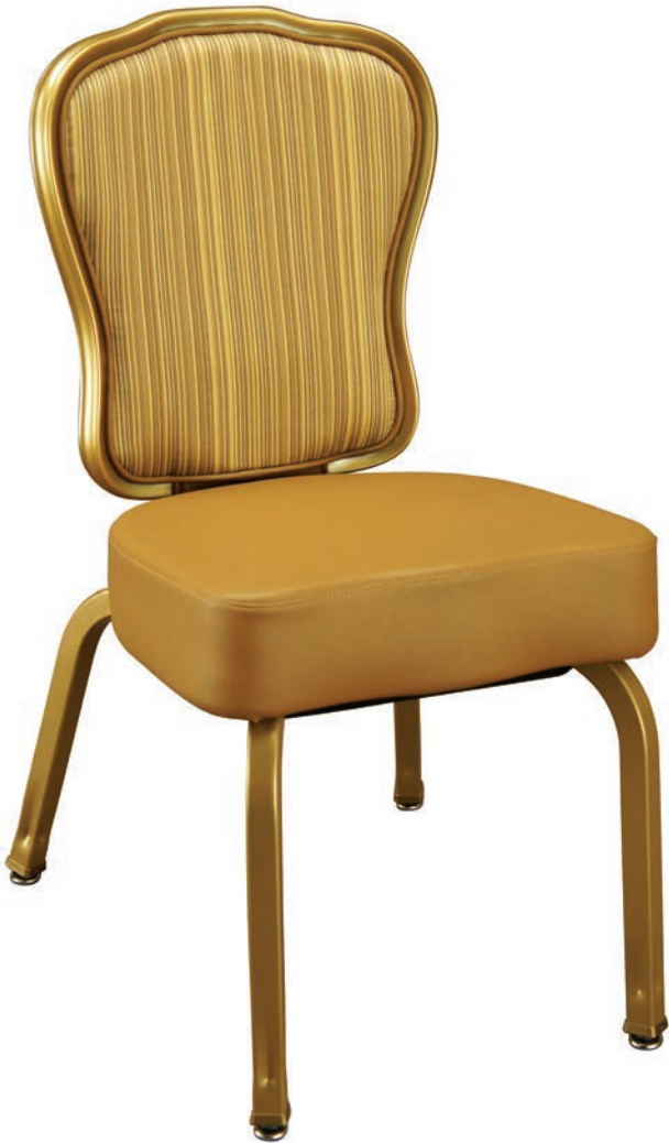
MSE-8800-S8 Shown with optional Murano Edge

Another one of our original and proven performers, the MSE, combines classic design and modern performance at a value you won't need to sit down for. The wider MSE is perfect for venues where style and guest comfort are the highest priorities. The MSE is the chair your guest desire.