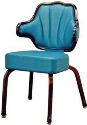
ASE-1217-S6 Shown with optional Channel Tufting