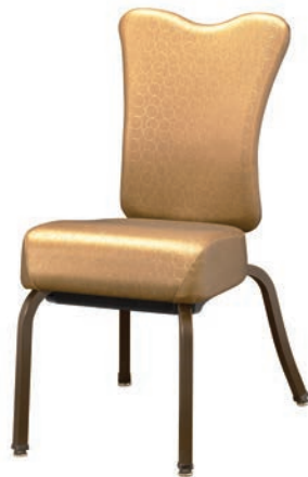
SLA-101-S8 Shown without Hand Grip